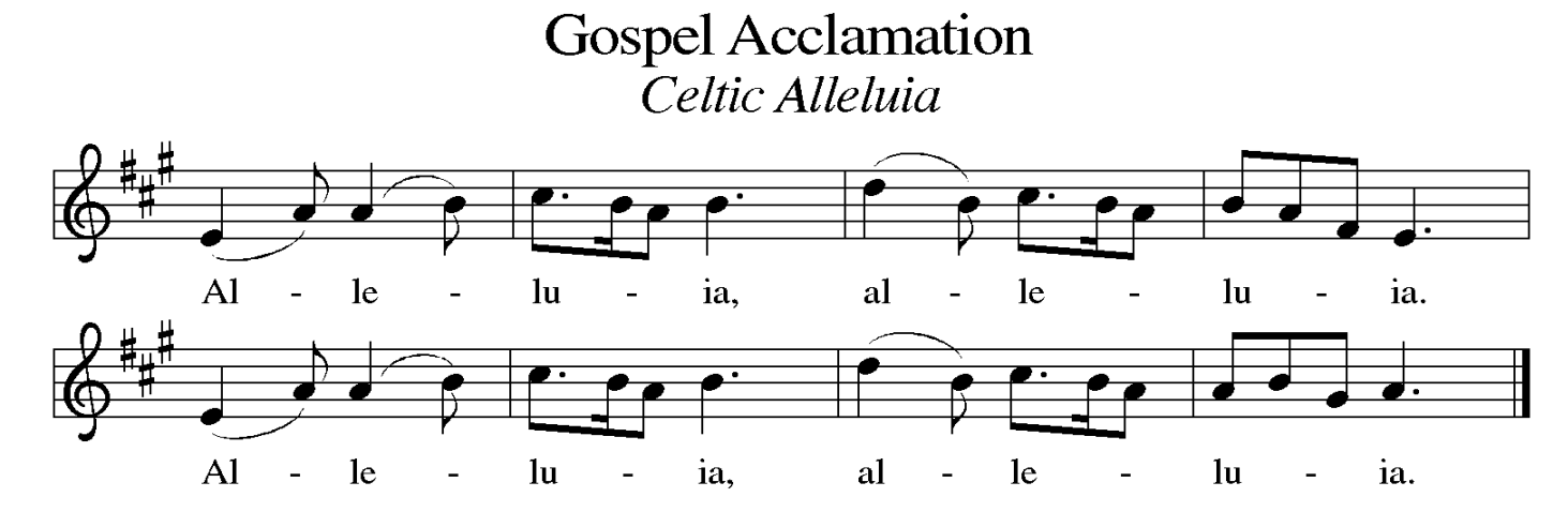
Verses may be sung by a leader. Then the alleluia is repeated.