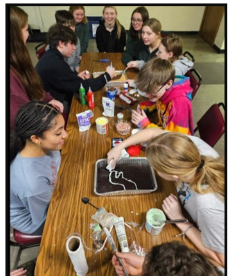
Baking Cakes at the Birthday Bash!