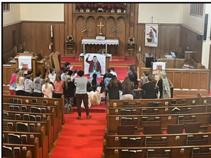
Worship at St. John's Birthday Lock-in