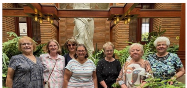
Visit to Darwin Martin House on Aug. 21