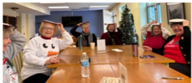
Try drawing a snowman on top of your head!!